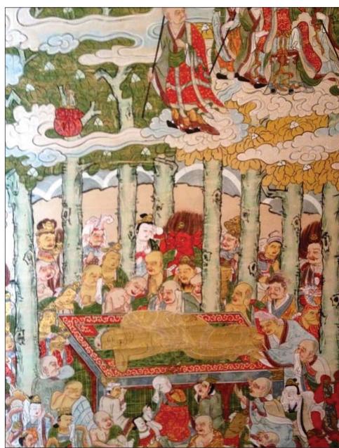
The Parinirvana Scroll

Someone was telling me that because of the influence of my mother, we are having a rather unique development in that my senior disciples are doing things in their own unique ways. Until this was mentioned, I did not think I was doing