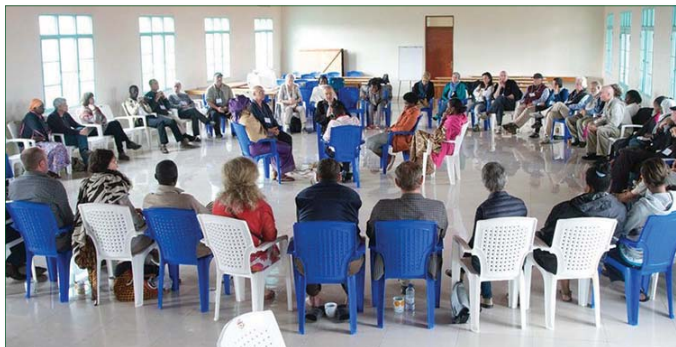
This “spiral council” concluded the Zen Peacemakers Bearing Witness Retreat in Murambi, Rwanda.

Working with the Zen Peacemaker Order has been dynamic, provocative and deeply nourishing. It is extraordinary and intense to step into a Council after bearing witness to the Childrens’ Barracks at Auschwitz-Birkenau, or the horrific remains of the massacre at the church at Ntarama, outside Kigali. The dehumanizing realities of prison life in California are also profoundly challenging to face. And when we listen completely to what is manifesting in our hearts, and in the hearts of those with whom we sit in Council, we become more intimate with the situation at hand.