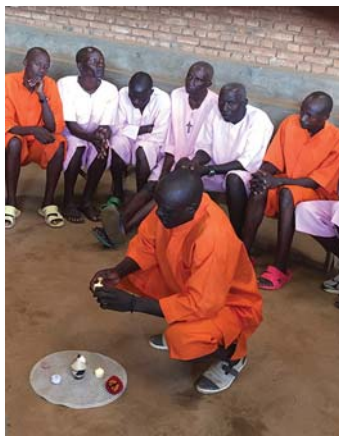
An inmate at Gasabo Prison lights the candle of Council.

These results have been quite striking, and the Center for Council has received support to broaden its Inmate Council Program to include twelve maximum-security prisons in California. One of the ripples of this program has been an invitation to offer Council-based programs to correctional officers, designed to shift the culture from stress, burnout, denial, and untreated trauma to more healthy self-management and self-care, emotionally and socially intelligent communication, effective stress and conflict management, and overall staff wellness and safety.