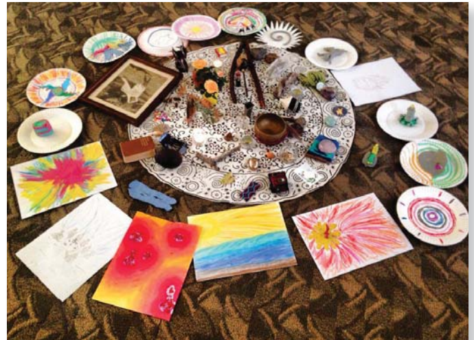
A recent Council Training Workshop in LA, integrated art and visioning. In the center are the talking pieces.

As director of the Center for Council, I have been responsible for developing and supporting Council trainings and programs locally, and throughout the world, in prisons, hospitals, community and environmental groups, social-profit organizations, social service agencies, and businesses. By sitting in quiet and contemplative sharing, Council participants report that they feel “more heard and