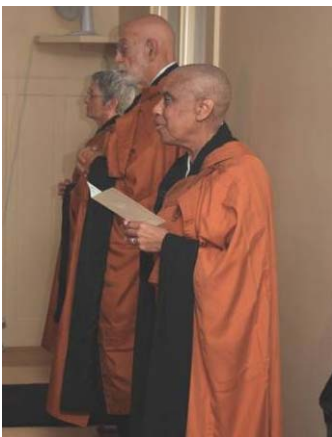
Sensei Kodo offers encouraging words during the 2011 Practice Period Entering Ceremony.

* By “conditioned,” the Buddha meant anything that arises from causes and conditions, which is all forms, the 10,000 things. What is changeless and exists before causes and conditions? It’s the same as asking, “What is your original face?” ■