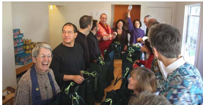
Assembling the Dana Baskets.