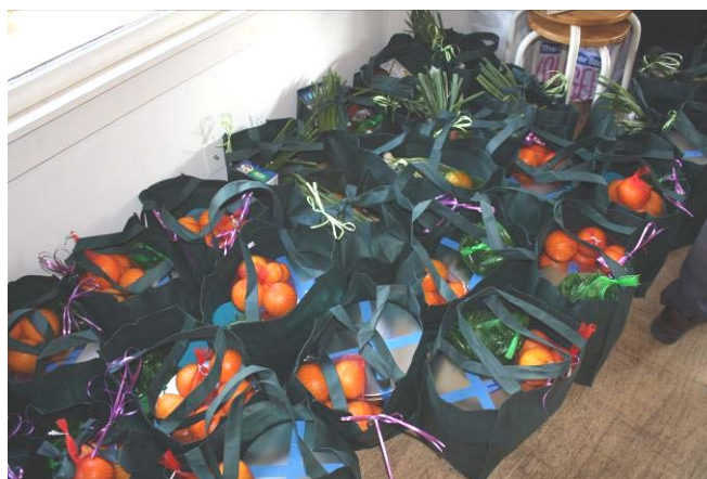
Dana Baskets assembled: many hands and eyes working together.